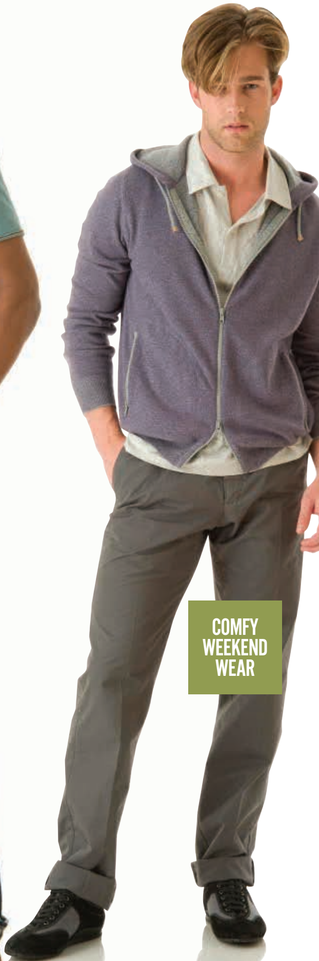
COMFY WEEKEND WEAR