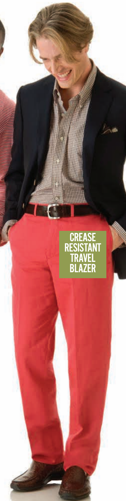
CREASE RESISTANT TRAVEL BLAZER