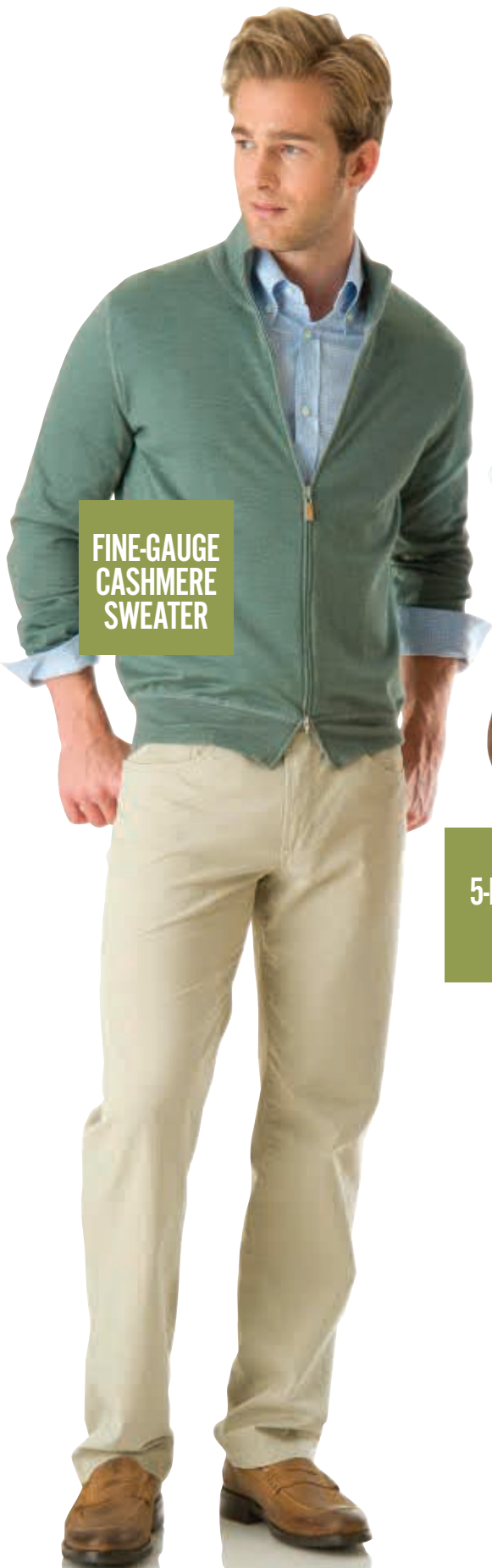
FINE-GAUGE CASHMERE SWEATER