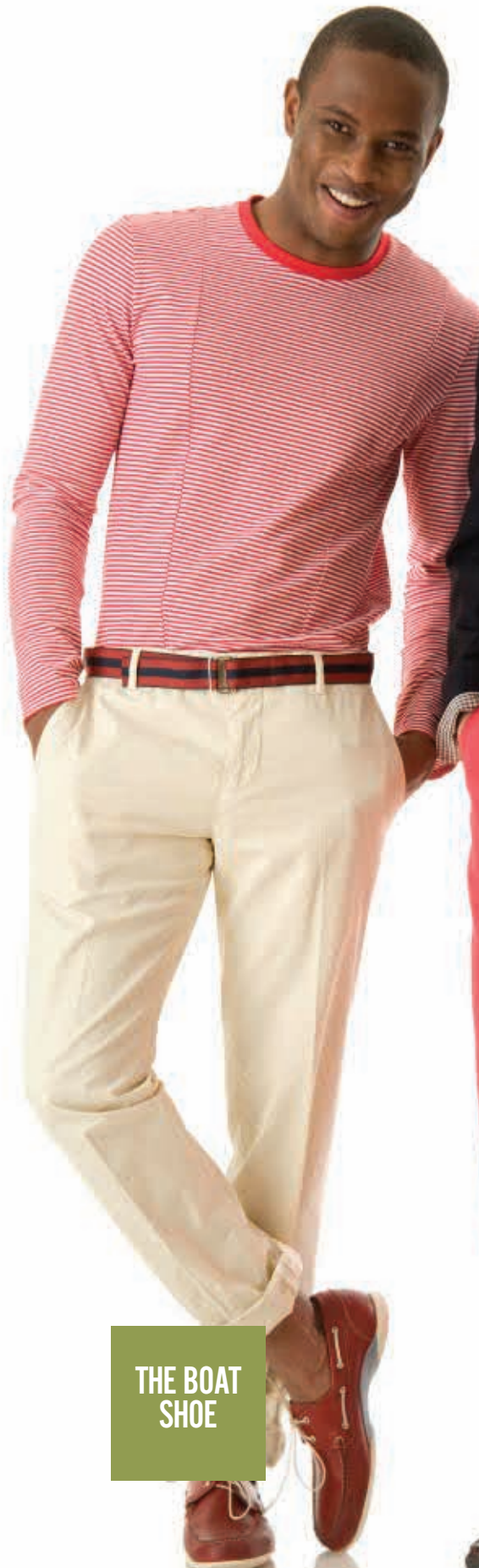
THE BOAT SHOE