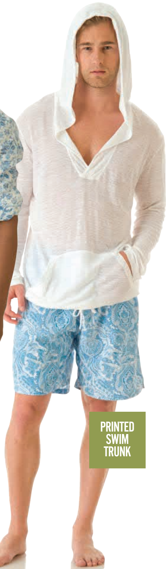
PRINTED SWIM TRUNK