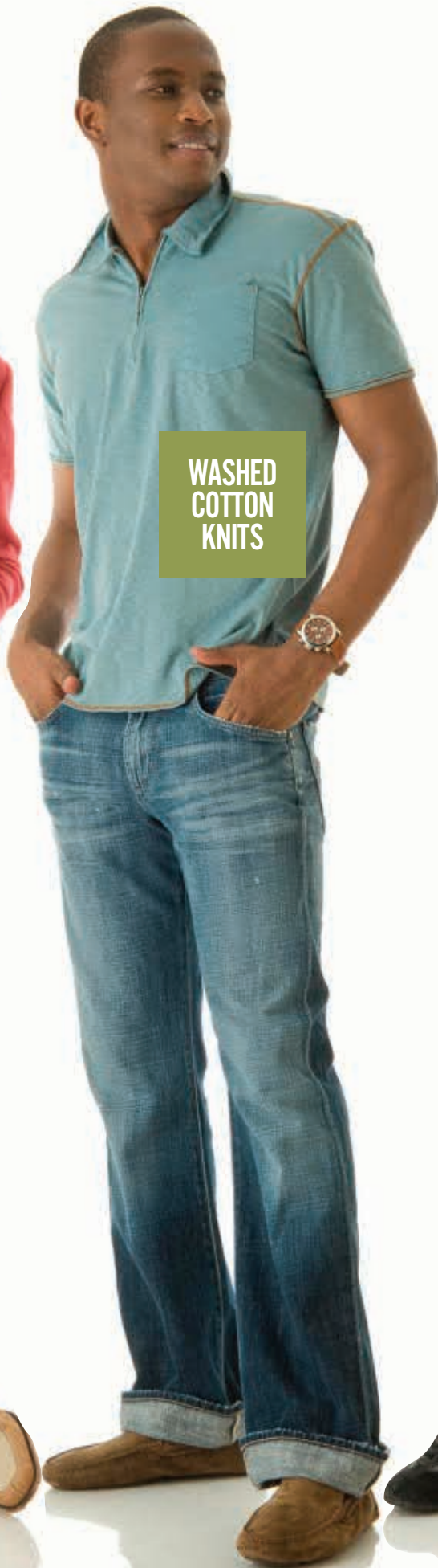
WASHED COTTON KNITS