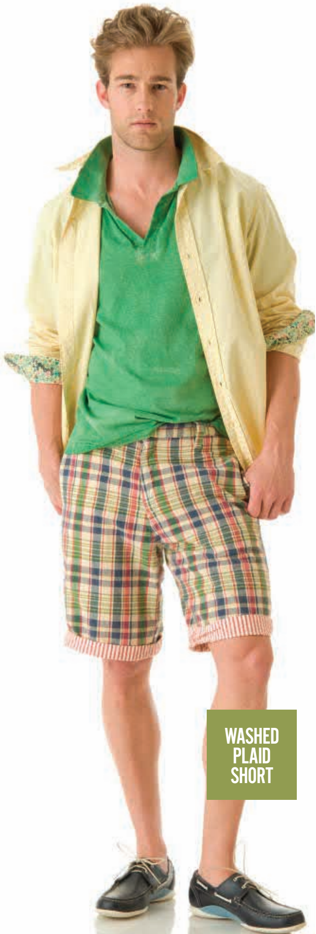
WASHED PLAID SHORT